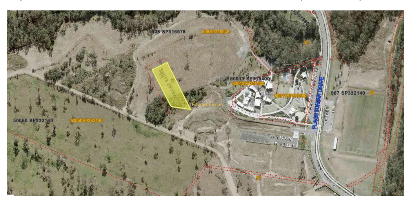
Figure 1: Location of the proposed Flagstone DCC.

Logan City Council is seeking submissions from First Nations artists who are interested in developing First Nations designs relevant to the Flagstone area. These designs will be incorporated into the facade of the Flagstone Community Centre to be located on Lot 30013 Parklands Drive, Flagstone (refer Figure1 ).